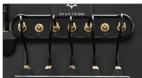
H + V configuration